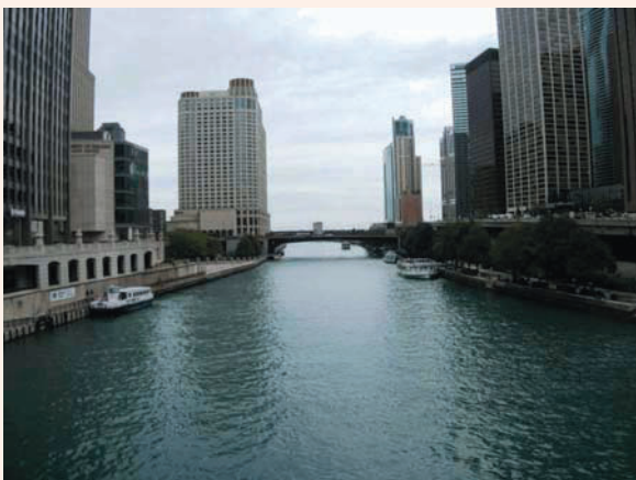
The Chicago River