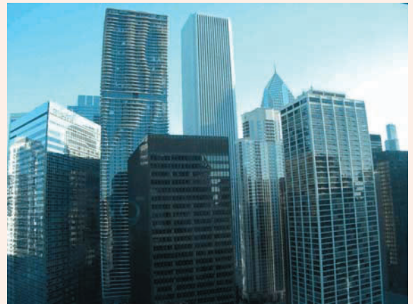
The Chicago Skyline