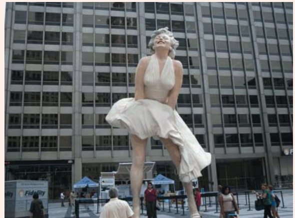
The Marilyn Monroe statue on Michigan Avenue